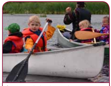
Campers enjoying time on the water

July 21 to 24 marked the fourth anniversary for Camp Wildrose in Darwell, Alberta, with 30 campers, eight tag-alongs and a staff of 24. Families travelled from various parts of British Columbia, Saskatchewan and Alberta to enjoy this four-day children's camp for ages 5 to 13.