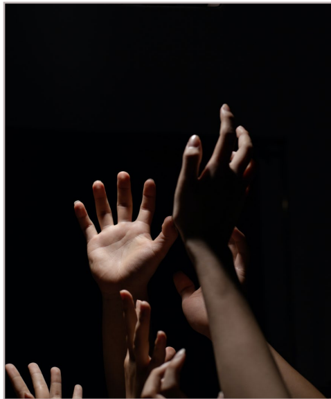
Many hands reaching out

ed for obeying God and was very wealthy. Thus, humans were given the opportunity to give a tithe plus an offering even in Abraham's day. Later the nation of Israel was given precise instructions about tithing.