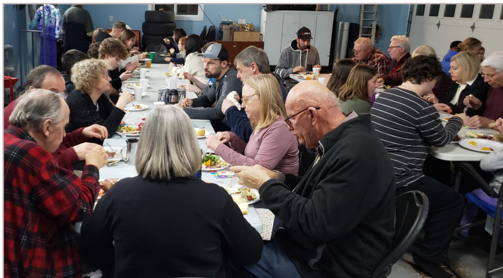
Edmonton brethren gathering indoors for a BBQ potluck