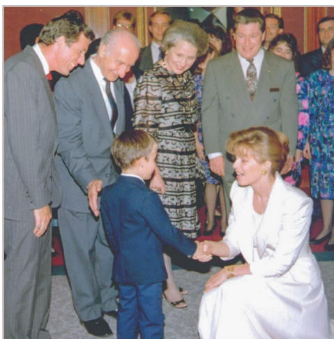
Meeting A Queen

Arriving at the palace, it was immediately apparent that this was a special location. Suddenly a lawn appeared – in a region where water is scarce! There were a few shade trees for us to stand under as we lined up to go one-by-one to meet the Queen