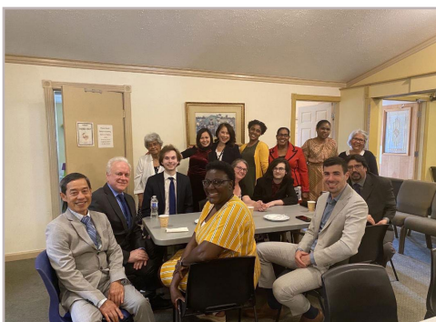
Pentecost In Surrey

"From whom the whole body fitly joined together and compacted by that which every joint supplieth, according to the effectual working in the measure of every part, maketh increase of the body unto the edifying of itself in love" (Ephesians 4:16).