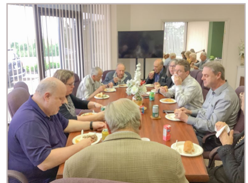
One of the tables on Sunday evening.

On Sunday evening there was a farewell supper at the National Office for those staying over Sunday night.