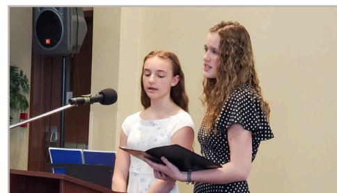
Special Music Presentation