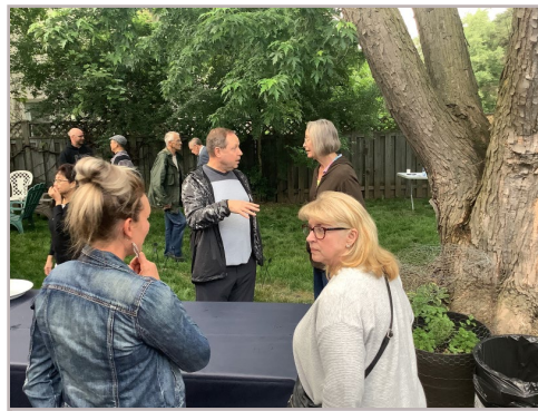
Gathering at the Wasilkoff's house.

and how we are to be building God's Temple.