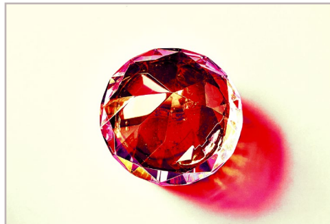
A Valuable Ruby

of wisdom and it is better than rubies (verse 11). Furthermore, wisdom promises that “those who seek me diligently will find me” (verse 17). The chapter further says those who keep the way of wisdom are blessed. It is obvious that knowledge, understanding and their application are the most valuable asset we can ever have.