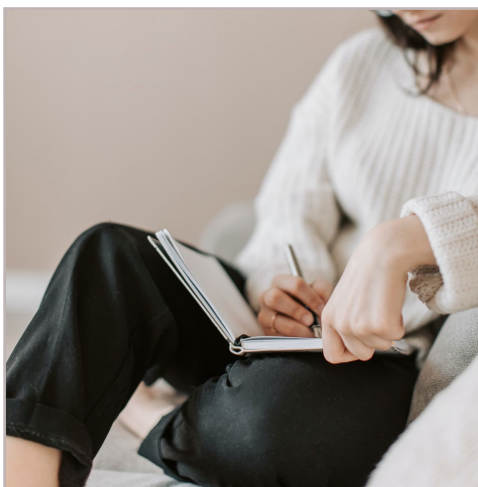
Preparing A List

Before I get ahead of myself here, let me explain. I am always excited about travelling, and I love the Feast! New friends, old friends, no work (hopefully) a chance to serve in a way I can't at home (I'm a newbie Usherette which I've come to love - especially when I'm at a Feast where I may not know anyone!). The fact that Fall 2023 seemingly has no sign of restriction is a miracle in itself coming from where we were, even from last year, so believe me - thankfulness is what I wrap myself up in, even while still shivering from what I still have to ac-