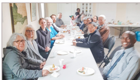
Brethren In Victoria