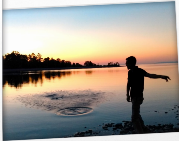
Sunset On Georgian Bay