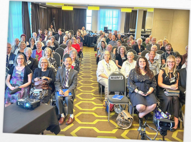
Ready for Services

through the middle three days was quickly forgotten as gorgeous sunny weather completed the Feast and the Eighth Day, giving everyone wonderful memories to