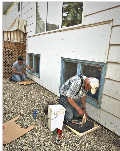
Working carefully together

God was present as well, showing us His presence in His miracles. Whether it was the purchasing of the paint and supplies for 50 percent off, the motel we stayed in giving us a large discount, the protection we had from the 30+ degree heat (100 bottles of water were consumed), keeping the rain away (other than a little shower during lunch one day) and holding back the forest fire smoke which was very heavy all around except in the small town we were working in.