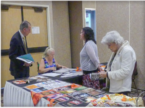
Information Table Gathering