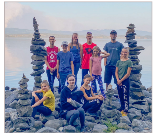
Beach Art & Friends

After dark it was time for the children to have s'mores and get out the glow sticks! Other activities included, fishing, hiking, swimming, tubing, kayaking and rock tower building during the day. The evening activities were campfire singing, fellowship-ping, as well as one stick horse race that both adults and children participated in.