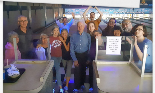
Bowling Fun