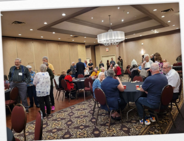
Meet & Greet Fellowship

A Seniors' Brunch on the morning of the first day kicked off the activities. This was followed by a Meet and Greet that evening.