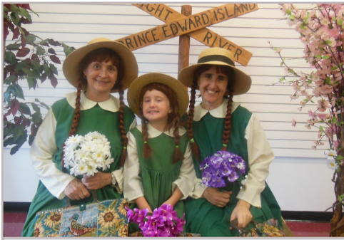
A few "Annes"