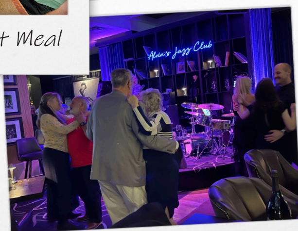
Dancing During the Feast