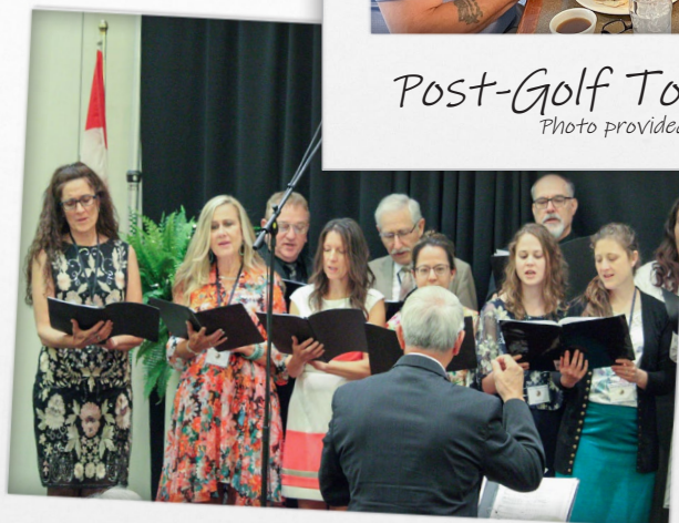
Praising God In Song