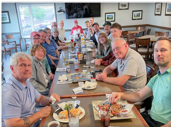
Post-Golf Tournament Meal

We had many group opportunities to grow our relationships with each other. On the first day of the Feast, we had a group dinner buffet to kick-start our fellowship. We had two additional times during the Feast when we had group dinners for all who desired. One was a group buffet dinner supplied by our Alberta congregations for all those who wanted to attend the famous Calgary Zoo. We had about 180 in total for this event. The last opportunity for a group dinner was at an upscale restaurant and Jazz club. Several took the opportunity to have a romantic dance