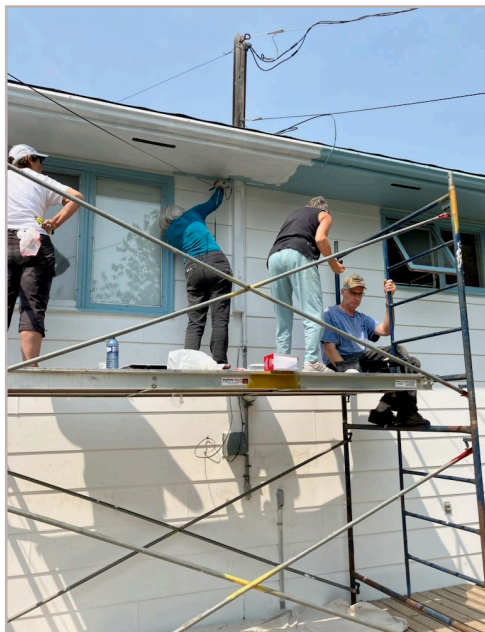
Working carefully together

While we were there, we also sanded and re-varnished the doors, repaired and painted the window frames and spruced up the garage.