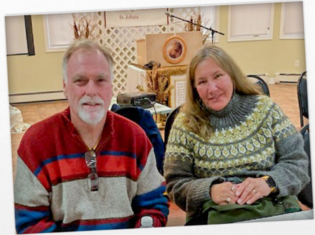
Preparing for a Group Meal