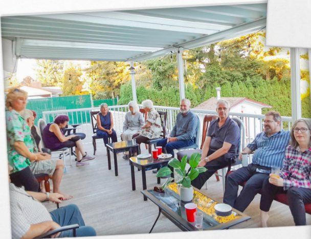
Fellowship Time