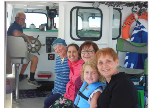
Enjoying a trip on the boat