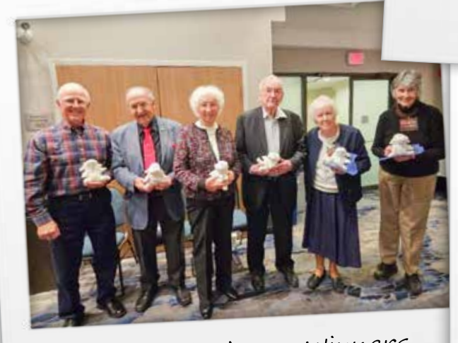
Seniors' Dinner Winners