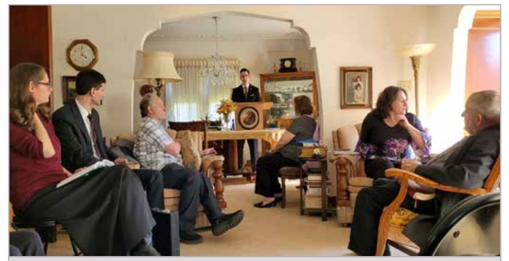
Windsor Brethren During Sabbath Service

the extra 40 kilometres at the last minute. Services started a bit late as people had to be contacted on their way to church. The setup group waited at the hall for those who weren't able to be contacted by phone. God always goes before His people leading the way to worship Him on His Sabbath day of special worship.