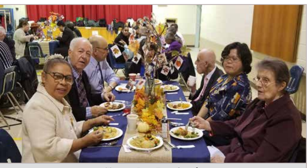
Toronto Post-Feast Social