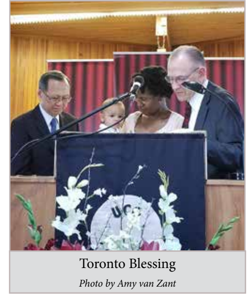
was blessed. While many were away with post-Feast illness, the attendance was still higher than anticipated.

Traditionally, the second Sabbath following the Feast is the day for the blessing of little children. This year the Toronto congregation enjoyed this wonderful ceremony as one infant