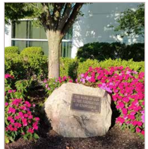
Decorative Rock With Engraving

"The word of God is the foundation of Knowledge ABC 2002". These words are written in stone on a large rock at the entrance to the Home Office in Milford, Ohio. This was placed there on behalf of the ABC class of 2002.