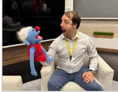
Meeting a VIP At The Home Office

ternational flavour of the entire group from Nigeria to Mexico, Chile, USA and Canada. Some used translators. We were all able to eat together in the Home Office. This gave us more valuable time to fellowship.