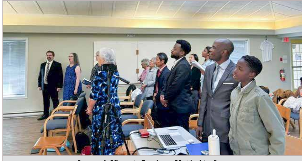
Surrey & Victoria Brethren Unified in Song

With this in mind, our Surrey church building was not available for services on September 14. That turned out to be a blessing, as a door was opened to us. How so? We had