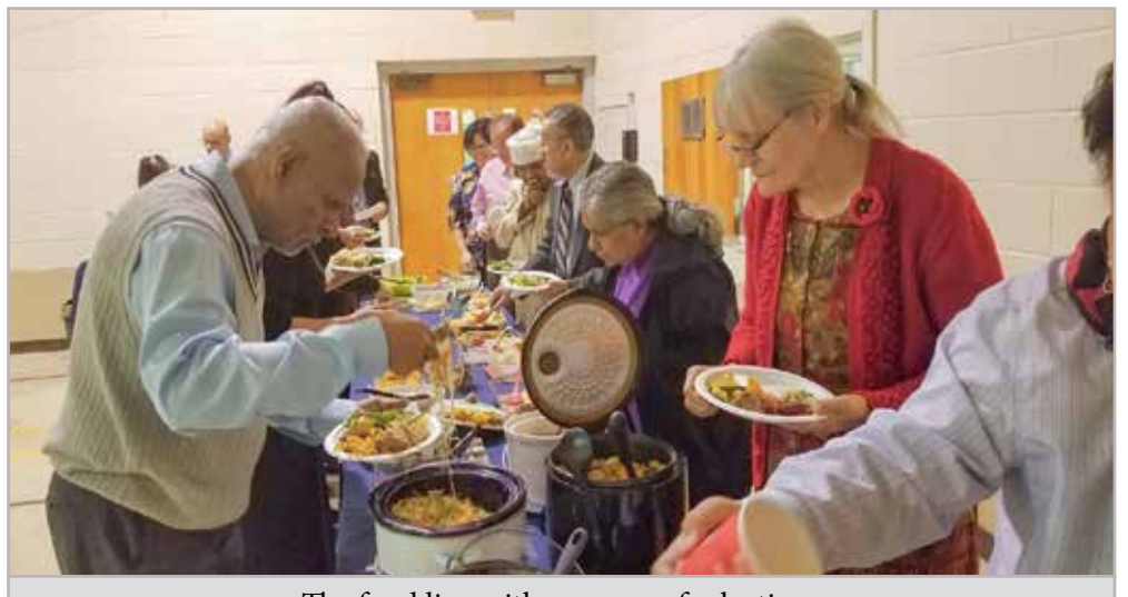
The food line with an array of selections

ahead of time so that these special "leaves" could be constructed. The table décor was rounded out with colourful leaves, gourds and mini pumpkins. It set the stage for a very enjoyable meal.