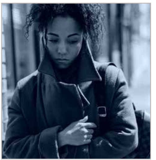
Some people have SAD

Unfortunately, some find themselves drinking more al-