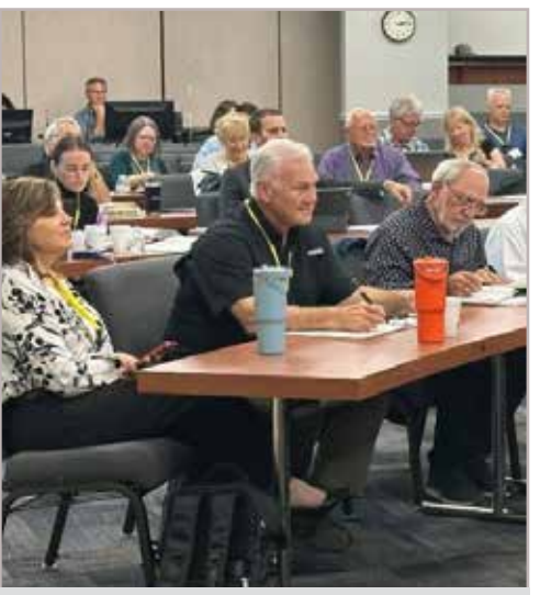
Attendees in Cincinnati