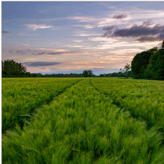
Barley Field

the shell) and dill -- all smothered with butter. Firstfruits are especially tasty in late spring or early summer and lend themselves to a satisfying meal.