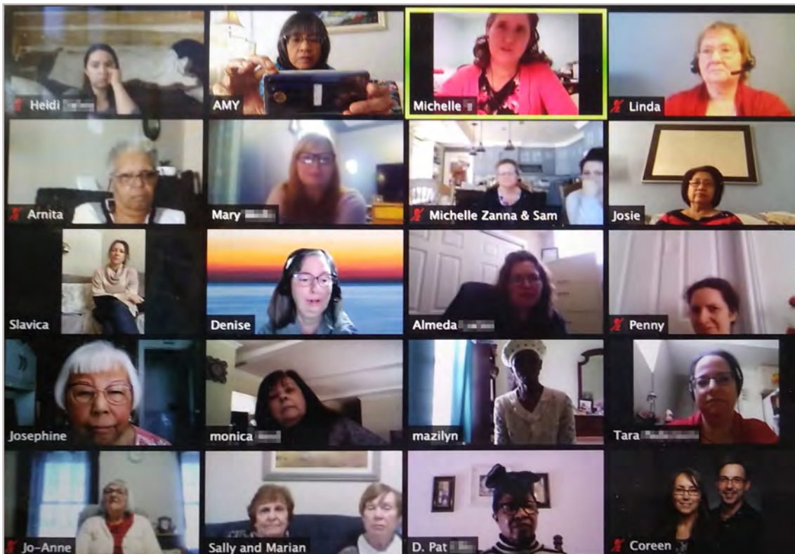
Participants In A Breakout Room

What impact did keeping Passover at home last year have on you? Will you do anything different this year?