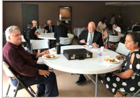
Maritimes brethren enjoying refreshments.

brethren was like a Feast gathering – something we don't get to experience too often when we live so far apart. Many brethren commented how much it meant to be able to give one another hugs again and to be able to meet.