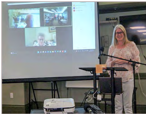
Participants were connected in-person and online.