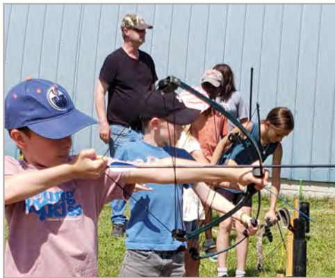
Archery requires careful aim.

Camp Wildrose is located on a country property near a large lake in the area of Darwell, Alberta. Joining us this year were 26 campers, ages 5 to 15, and 24 volunteers including four teen counsellors who worked wonderfully with the youth and participated in many activities. Attendees travelled from all over Alberta, from as far west as British Columbia and as far east as Ontario.