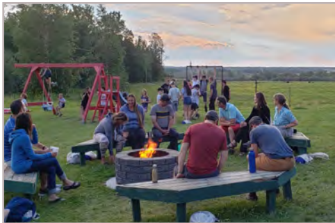
Enjoying an evening by the fire.

Camp Wildrose had a wonderful comeback summer session! Thank you for the prayers for good weather - it was warm and sunny all five days of camp!