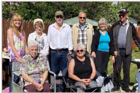
Enjoying fellowship and sunshine.

congregation within a month of their official beginning within the United Church of God – Canada. It is now 18 years later, and most of the warm smiles and welcoming hearts are still here. A few have moved from north-western Alberta's climate to other church areas and at least one attendee now sleeps awaiting Christ's return. The founding members have persevered, and the congregation has served as a Sabbath resting spot for travellers passing through north-western Alberta or for those on company business in our area.