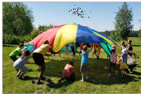
1 parachute + campers = fun!

Our theme this year was “Appreciating our differences - showing love and service to one another.” Christian living lessons focused on building our spiritual bonds, showing Godly love and learning to work together harmoniously while appreciating our God-given differences that make us special and important in God’s plan. Our first morning session taught a lesson in perseverance and trusting in our Creator to supply everything we need. The second session took a look into our spiritual suitcase to see if we packed everything we needed for an enriching camp experience full of Godly character traits.