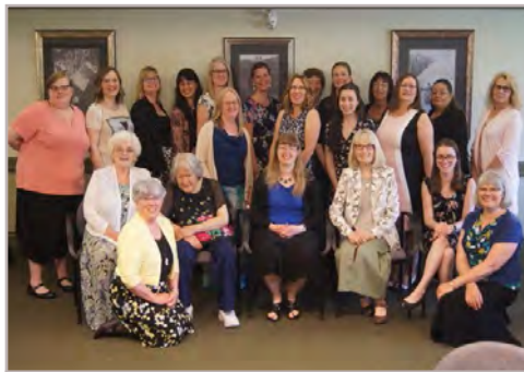
Attendees posing for a group shot.