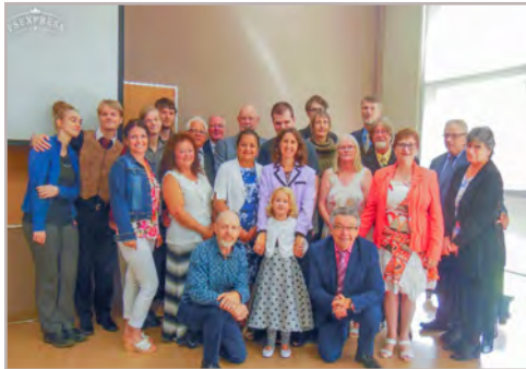
Attendees posing for a group shot.

We were blessed with the opportunity to gather together for two Sabbaths, August 6 and 13. There were a total of 24 in attendance with several others connecting via zoom including East Farnham congregation. Brethren drove a distance of an hour up to 3 1/2 hours for some. Fellowship was extended for an additional hour in the parking lot before brethren headed home.