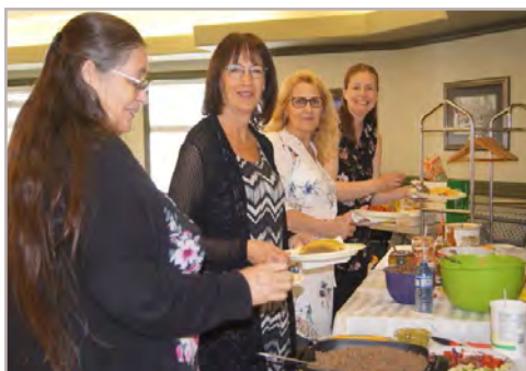
Preparing to enjoy a meal together.